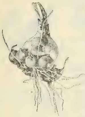
FIG. 2.— Muscari conicum bulb and bulblets grown in two years, from bulblets like the largest shown

Seeding should be done preferably in autumn or early spring. Any time from August 1 to November 1 gives good results on Puget Sound. Germination takes place in the spring even from August planting. In these experiments it was found most advantageous to put the seed in beds, because of the larger quantity which can be grown on a given area. Only handwork is applicable in handling seed and seedlings anyway. It is desirable to put the seed in thick, and this is accomplished by using rows across the